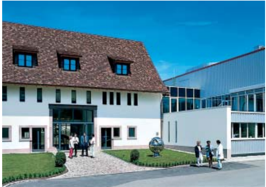
Technology Center at Binzen

Only Glatt can offer you this unparalleled scope of services - at the ground-breaking Technology Centers at Dresden and Binzen. Profit from the comprehensive range of services offered by these innovative high-tech centers which possess the necessary technologies and expertise. This guarantees the speedy launch of your products onto the market!