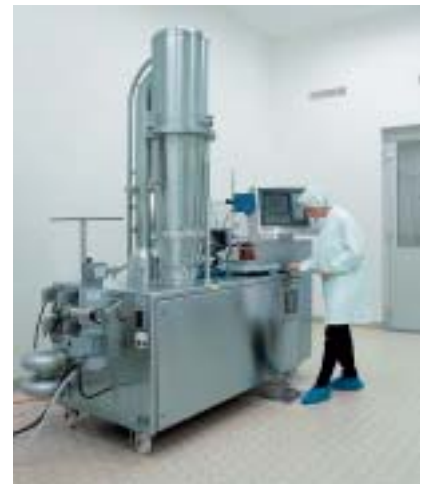
GPCG 3 - Laboratory fluid bed machine for small / development batches

As well as taking a lead in expertise, there is also a major time bonus. With Glatt, major development phases can be significantly reduced. We know your product and your project, so we can offer you the time bonus, backed up with the comforting assurance that the proven process will also function at production scale.