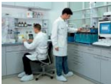
In-vitro release analysis