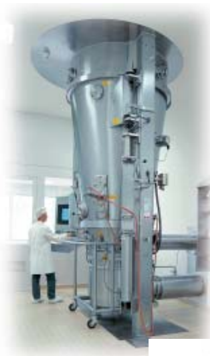
Fluid bed process in a GPCG 60 pilot machine