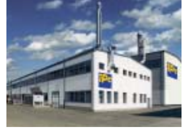
IPC Process Center GmbH, Dresden